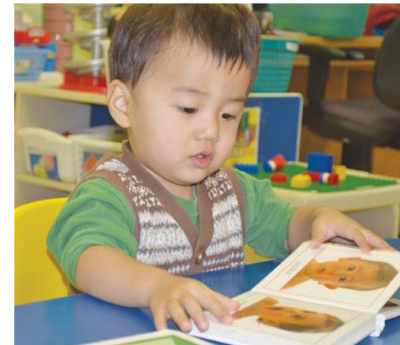
The new O'Connor Family Centre