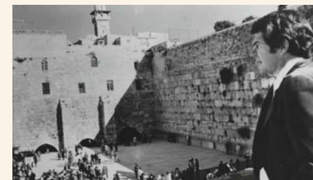
Pat Robertson on one of his many trips to Israel.

On Christmas Day in 1974, I had the privilege of interviewing Prime Minister Yitzhak Rabin in Israel for The 700 Club . Rabin lamented the fact that after Israeli military victories, the nation had been stopped from achieving a peace treaty.