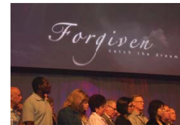
Canadian pastors and leaders

Two years later, a National Summit of the First Peoples of Canada convened to formally respond. In Ottawa on June 12, 2010, representatives from First Nations, Inuit and Métis from across the country met with Chuck Strahl, Minister