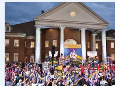
Every year, our staff gathers to rejoice in God's faithfulness and to pray for partners.

unemployed for 16 months, and the couple contacted The 700 Club for prayer. God provided him with a job!