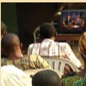
African villagers gather to watch The 700 Club .

Recently, I traveled to West Africa and met Ivory Coast's president, Laurent Gbagbo, who is a believer. When I asked how we could help his country, he asked us to pray for him and for his nation. I am so thankful that through your prayers and support, you are proclaiming hope across his nation, throughout Africa, and around the world.