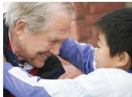
Pat Robertson visits a CBN-supported school in China.

For years, CBN partners have been demonstrating the love of God to people throughout China. Through water wells and cisterns, medical outreaches, school tuition programs, food, and clothing, CBN partners have been preparing Chinese hearts to receive the Good News. Please continue to pray for the people of China.