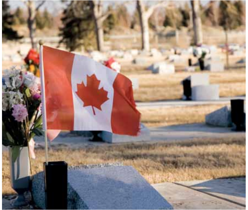
The lives lost by Canadian men and women in battle have forever blessed their country.