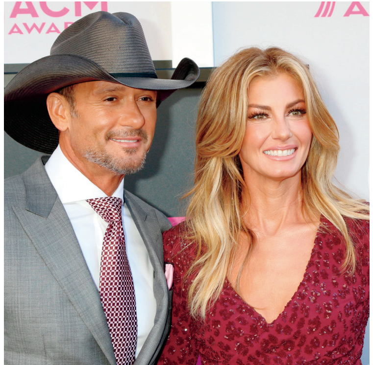
For this celebrity duo, prayer and spending time together is a priority.

Faith Hill and Tim McGraw give their secret to a successful marriage