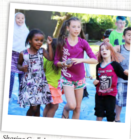
Sharing God's love through outreaches to underprivileged children.

YOU ARE THERE all summer long as the Metro Kids Society reaches children through their “Sidewalk Kids Klub” outreach programs! Kids from underprivileged neighbourhoods partake in games, songs and contests with the staff and receive valuable Christian life lessons through teaching time and Superbook episodes.