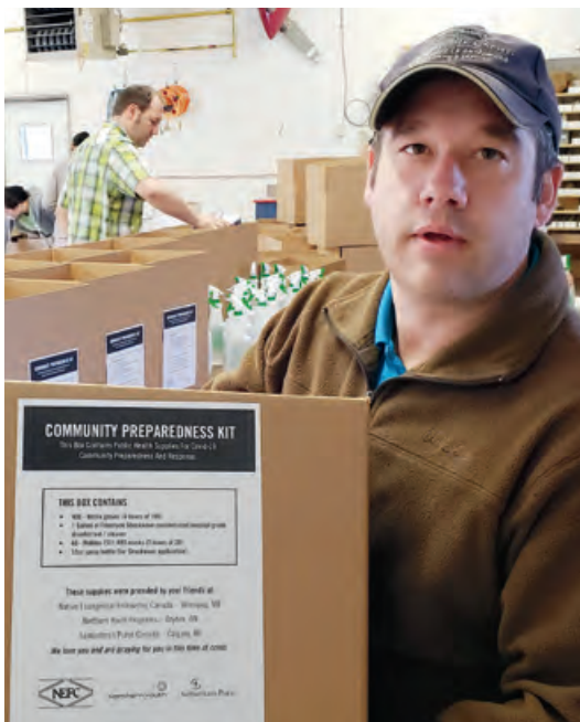
Your support provides food and supplies.