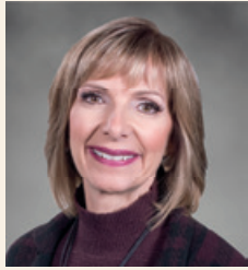
by LORIE HARTSHORN Co-Host, The 700 Club Canada