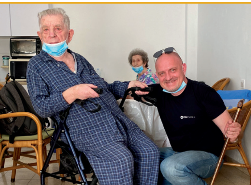
Partners like you make a difference in the lives of World War II veterans.

partnering with us through our partner ministry Leket Canada to help with the distribution of surplus nutritious food in Israel to those who need it.