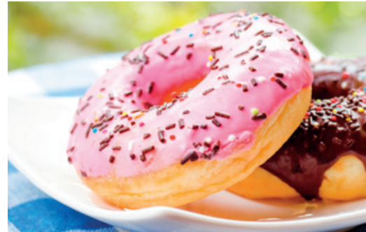
Sugary and salty foods can “excite” the brain.

Not just a stunning exposé, Hooked will show the way to better eating habits—for a lifetime.