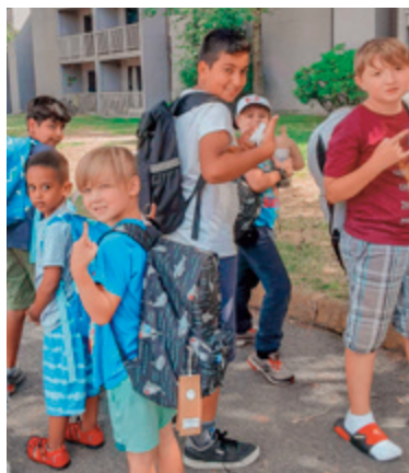
Generous partners help share the Gospel with children.