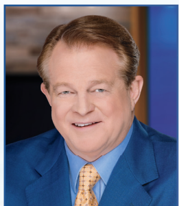
By Gordon Robertson President and CEO, CBN

When I became a grandfather not too long ago, I was reminded of how much I learned about God when I became a new dad.