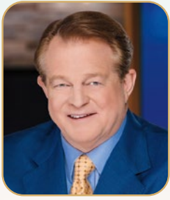
By Gordon Robertson President and CEO, CBN

As we prepare for Easter next month, let's ask the Lord to renew our faith with a fresh appreciation of what He has done for us.